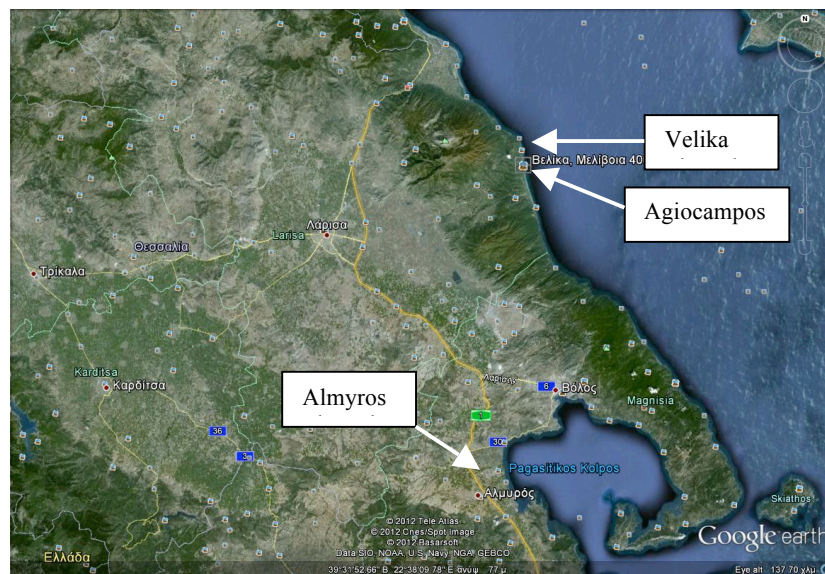
Figure 4. Thessaly and locations of salt-water intrusion (Google Earth image).

In Thessaly, where the water table is estimated to drop by 5 m every year, at several coastal locations, along the Velika-Agiocampos coastal line and at Almyros (Figure 4), where fractured carbonate formations are encountered, severe salt water intrusion problems have appeared. Similar problems exist in coastal locations in Athens where the water table was found in 1996-97 to lie 10 m below the elevation of the sea. Similarly, salt water intrusion problems were detected at the northwestern part of the Messara plain, the Tymbaki basin, by transient electromagnetic, vertical electrical soundings, and radio-magnetotellurics surveys (Pipatpan and Blindow, 2005).