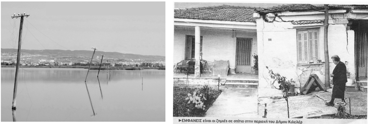
Figure 1. Left: Submerged electricity poles at the Kalochori area, Greece (Mouratidis et al., 2009). Right: Land subsidence in Thessaly, Greece (newspaper "Ethnos, January 31, 2012).

Land subsidence became noticeable in the 1960s with marine invasion and flooding first appearing in 1964. The fact that the uniform subsidence that has occurred is localized to the Kalochori-Sindos area excludes regional scale tectonic effects as the cause of the phenomenon. Subsidence is considered to have been caused mainly by consolidation, i.e. compaction of the