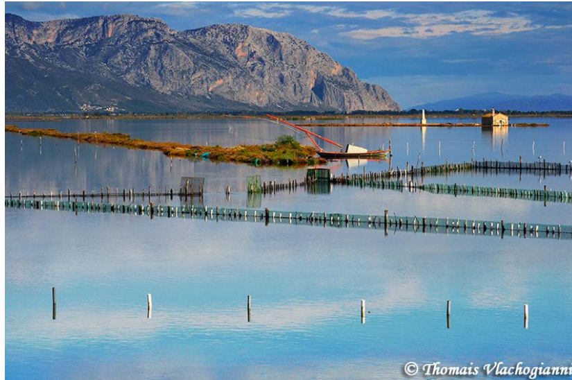
Figure 3. Messolongi lagoon.