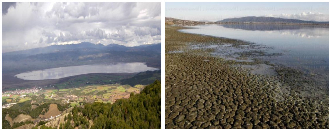
Figure 11. Lake Koron(e)ia. The surface of the 4 th largest lake in Greece declined progressively in 30 years and its volume and surface area of water was reduced by 80%. The lake was surrounded by farmland and in the 1980s it suffered from increasingly intensive agriculture, industrial liquid waste and municipal waste water from the neighbouring town of Lagadas

for local fauna and flora. Although a comprehensive plan is in place to rehabilitate the lake, with many actions partly financed by EU funds, progress has been slow. At the recommendation of Environment Commissioner Janez Potočnik, the EC resorted to bring the case to the Court of Justice [ http://europa.eu/rapid/press-release_IP-11-89_en.htm ].