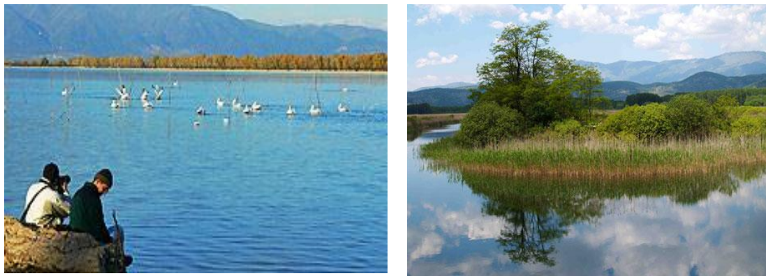
Figure 4. Kerkini lake (left) in spring and summer is a veritable paradise for birdwatchers. Agras-vritta-nisi wetland (right), situated 7 km NW of Edessa and covers an area of 600 ha.