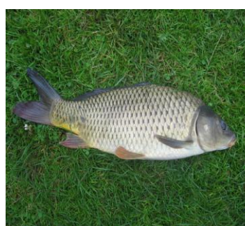
Cyprinus carpio κυπρίνος ή γριβάδι

The presence of copper (Cu) and zinc (Zn) in fish species of the Lake Pamvotis was the subject of a study for the heavy metal pollution at high concentrations in the waters of the lake. The fish species studied were Cyprinus carpio , Silurus aristotelis , Rutilus ylikiensis , and Carassius gibelio . Metal concentrations were measured in three different tissues of fish (muscle, liver, gonads). The study showed that C. carpio and R. ylikiensis presented the highest metal content. Metal concentration in the edible part of the examined fish (muscle) were in the safety-permissible levels for human consumption. 63