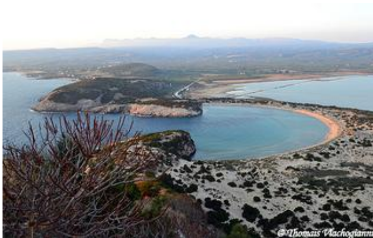
Figure 14. Greece has some spectacular wetlands. Voidokilia beach, Gialova lagoon (Γιάλοβα), SW Peloponnese (Navarino Bay). It is a Natura 2000 site of major importance

this investigation was the evaluation of findings for planning of effective management and conservation policy of wetlands, incorporating the opinions of local residents. The increased awareness of local residents of the value of wetlands, tourism or agriculture development (in some cases), as well as more governmental support, became obvious results from this research. 79 A similar study on reformation of cropland in the ecological sensitive area of lake Vegoritis was carried out. 80