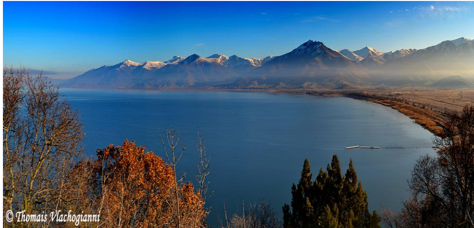
Figure 2. The spectacular and significant Great Prespa Lake shared under a landmark agreement between Greece, Albania and the Former Yugoslav Republic of Macedonia.