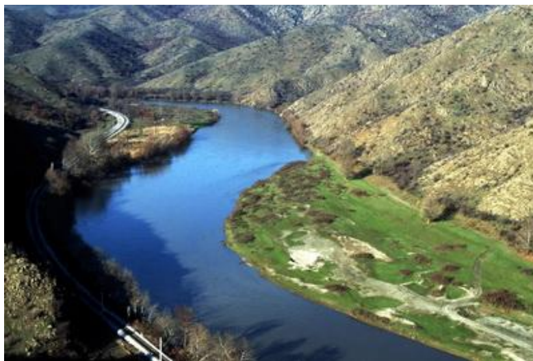
Figure 1. Axios is the second longest river in Greece with a total length of 320 km, of which 76 km are in Greece. It is estimated that Axios receives 1.140.000 m 3 of industrial waste only from Greek industrial enterprises per year

There are more than 40 of natural and artificial lakes in Greece, as well as many lagoons. Most lakes are freshwater and have formed mainly far from the coastlines as a result of tectonic or volcanic forces, or from the melting of glaciers. There are also lakes with salt or brackish water, when the substratum contains many soluble salts or it receives an inflow of saltwater. Greece has artificial lakes, which have been created by the construction of dams in brooks, streams or rivers in order to store water for various objectives (irrigation, farming, drinking water, etc). Lakes in Greece cover a considerable area (560 km 2 ) and have