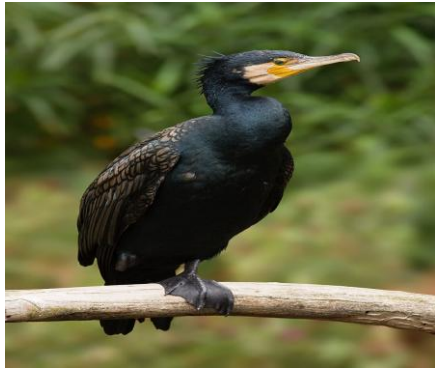
Cormorant ( Phalacrocorax carbo sinensis )