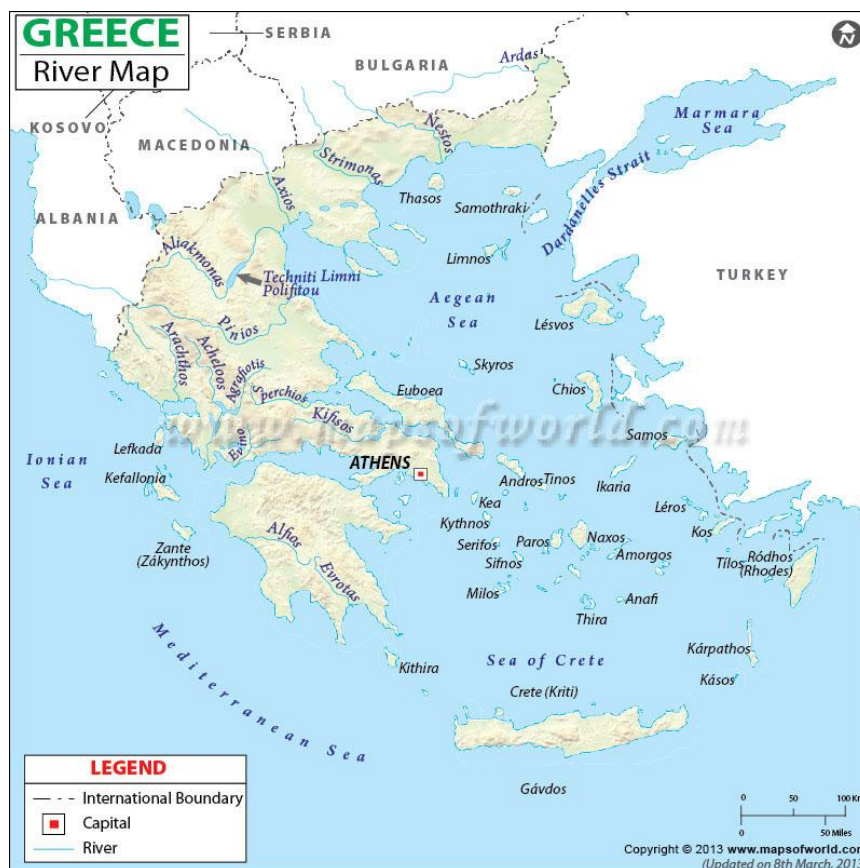
Figure 7. Greek rivers are heavily polluted in most highly populated areas. Effluents of fertilizers and pesticides from agriculture, liquid waste from stock farming and industries are main pollutants of Greek rivers. [ http://www.mapsofworld.com/greece/greece-river-map.html ]

extended admixture of seawater. COD (chemical oxygen demand) values fluctuated seasonally. Among the studied stations along the Pinios River the most polluted was the area where the river has passed the city of Larissa (municipal liquid and solid waste). 18