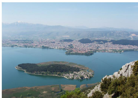
Pamvotis lake (Ioannina, Epirus)

Figure 10. Evros river accumulate effluents from industrial sites, farming and urban pollution sources. The lake Pamvotis (Ioannina) is impaired by pollutants from sewage, which significantly exceed permissible limits.