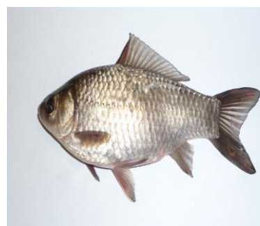
Carassius gibelio Εμπειρικό όνομα πεταλούδα

Figure 10. High metal concentrations (such as Cu and Zn) were detected in the tissues of fish in the lake Pamvotis (Ioannina) but in the range of safety-permissible levels.