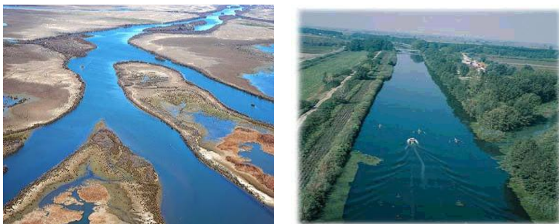
Figure 6. The Axios-Loudias-Aliakmonas Delta has a very important biodiversity. The Axios delta (left). The Loudias river (right) is the most polluted river in the North of Greece as a result of industrial effluents from food and sugar refilling industries