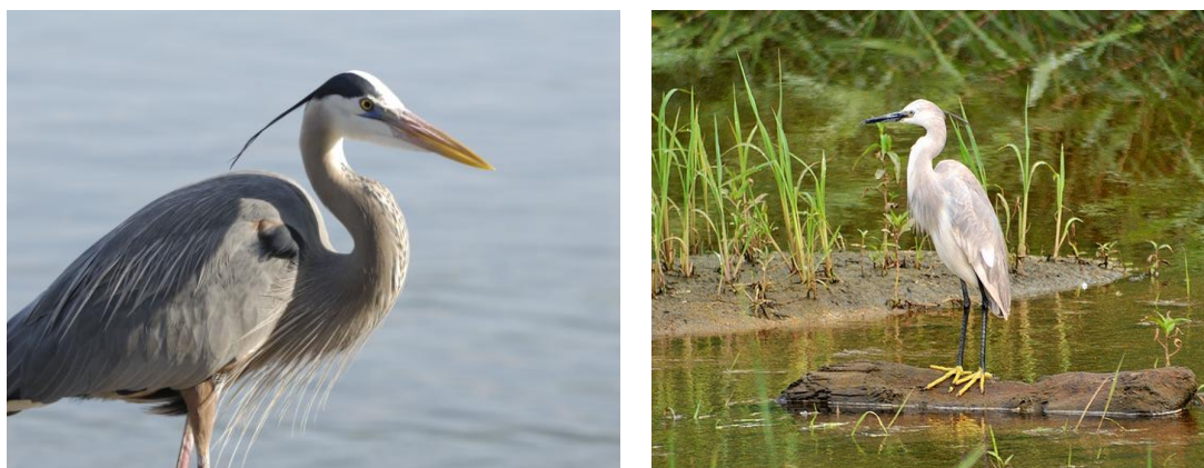
Figure 8. Many rivers and lakes in Greece have rich biodiversity. Heron. Herons are long-legged freshwater and coastal birds in the family of Ardeidae. Little Egret, ( Egretta garzetta ), is a small white heron.

Organochlorine pesticides were analysed (1992-93) in birds and frogs in the wetlands of the Thermaikos Gulf (Thessaloniki). Organochlorine insecticides were determined in eggs and freshly dead chicks of the Squacco heron ( Ardeola ralloides ), Little Egret ( Egretta garzetta ) and Night Heron ( Nycticorax nycticorax ), as well as in frogs ( Rana sp.), the main heron prey. Residues of the organochlorine pesticides \alpha -BHC ( \alpha -Benzenehexachloride), \beta -BHC, lindane, 4,4'-DDD, 4,4'-DDE, heptachlor and dieldrin were found in the eggs, chicks and prey of the herons. \alpha -BHC, \beta -BHC, and lindane had highest concentration in the Night Heron and lowest in the Little Egret. Variation in the pesticide contents in the different heron species is attributed to different feeding habits. The concentrations of pesticides detected in the study were too low to affect eggshell thickness in the Heron or have other effects on the wildlife of the area. 34