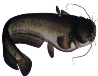
Silurus aristotelis Γλανίδι