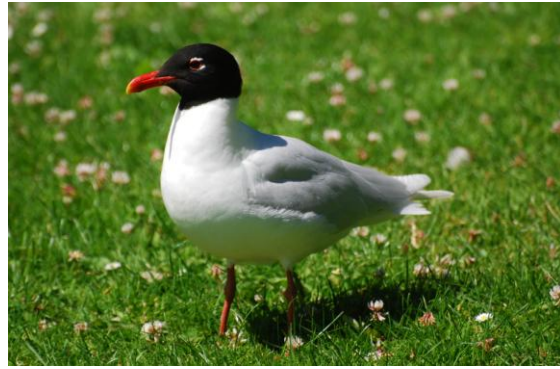
Mediterranean gull ( Larus melanocephalus )

Figure 13. Birds in wetlands. Environmental pollution and concentrations of organochlorine pesticides and heavy metals can become useful bioindicators in ecotoxicological studies.