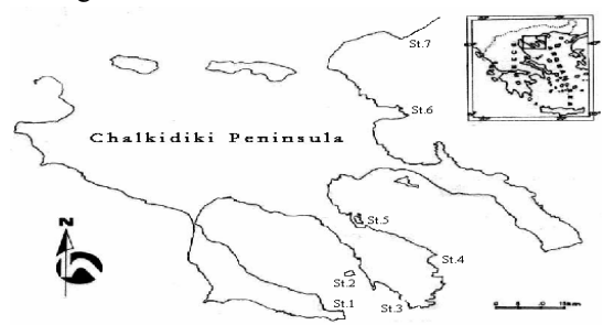
Fig. 1. - Map of the study area, showing the location of sampling sites.

The present study discusses in detail the molluscan diversity, and qualitatively illustrates its spatial dispersion in the lower infralittoral hard substrate assemblages in the North Aegean Sea.