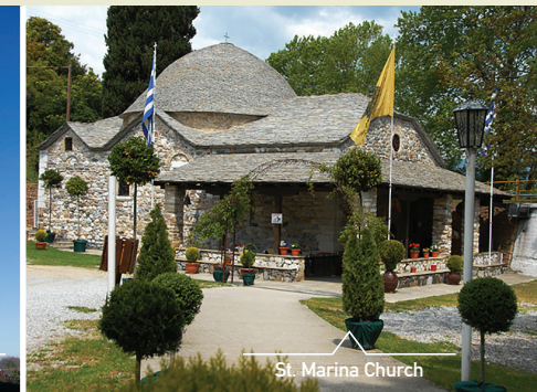
St. Marina Church