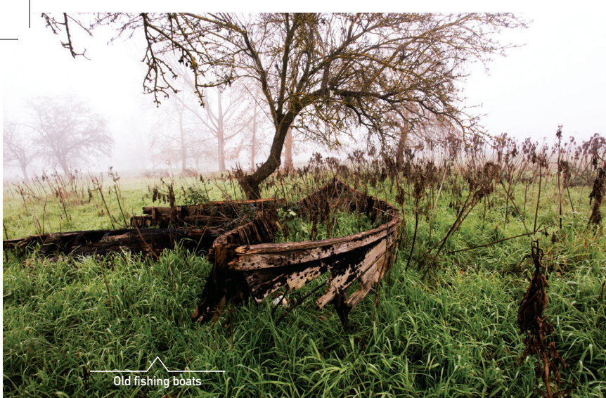
Old fishing boats