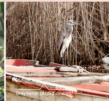
Grey heron ( Ardea cinerea )