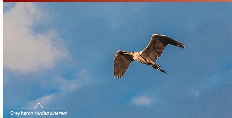
Grey heron ( Ardea cinerea )