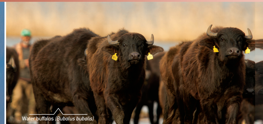
Water buffalos ( Bubalus bubalis )