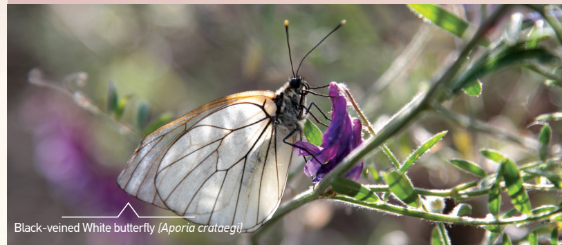
Black-veined White butterfly ( Aporia crataegi )

Zone A1, the Apollonia forest, is designated as a complete protection area and zone A2, the Macedonian Tempe, is designated as a nature protection area.