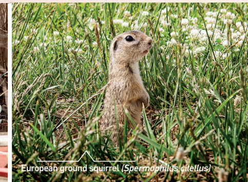
European ground squirrel ( Spermophilus citellus )